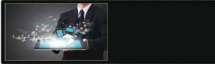
LCD + SIDE 2m

e-Blackboard can be made on demand combining all types of LCD active panels, capture panels and passive panels: