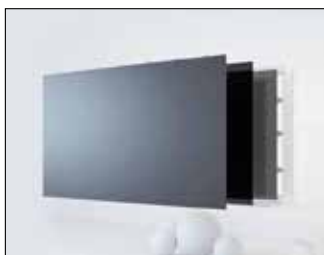
Viewing angle 178°

Perfect for those centres or environments where image plays an important role: business schools, highly technological environments, corporate centres, etc. Its matte black anti-reflective finish, with a polished aluminium frame, and all the integrated elements make the e-Blackboard an elegant and attractive device as well as functional.