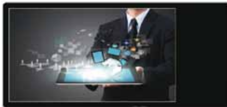
LCD + SIDE 0,5m

Passive side to left, right or both sides