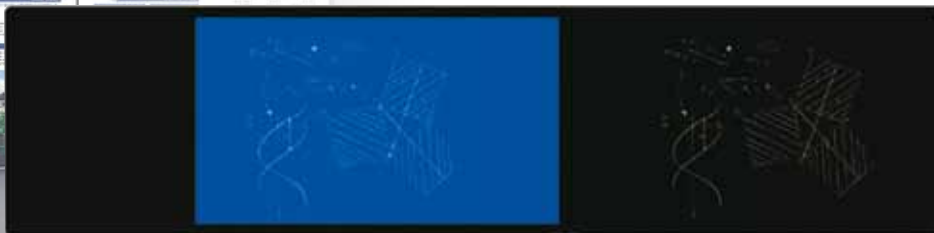
CAPTURE + SIDE