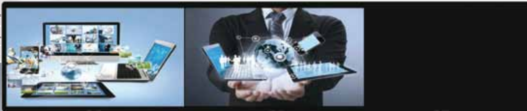
DUAL LCD + SIDE

Passive side to left, right or both sides