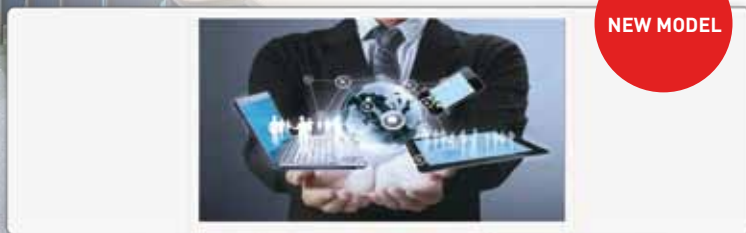
FULL SIZE 4M WHITE