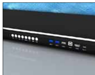
Front access to connections