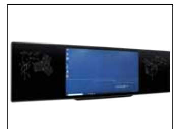
Complete comprehensive system

According to the ICT managers of several educational centres where e-Blackboard has been installed: